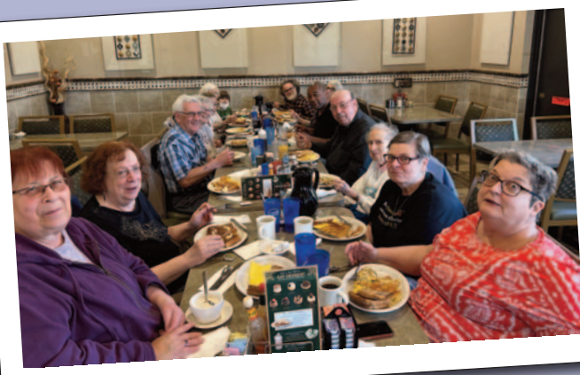
"The Breakfast Club"

Jan visits the wood shop for some auto repair.